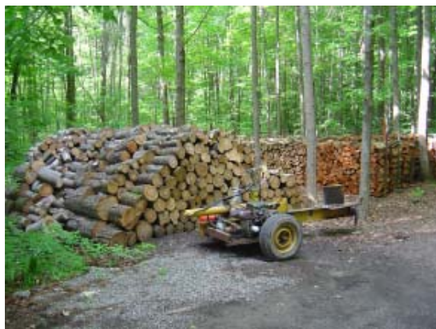
Stacking firewood on the ground can increase the risk of insect and fungal infestation.

Ants, termites, other insects and mice can be a problem if firewood is stored too close to the house, or if infested wood is brought inside. To keep ants, termites, other insects and mice away, firewood should be stored outdoors away from the house and under a shelter or tarp. Keep firewood dry, off the ground, and stacked so air can circulate through the ranks. Avoid storing firewood in the forest where wood-eating insects can infest the logs.